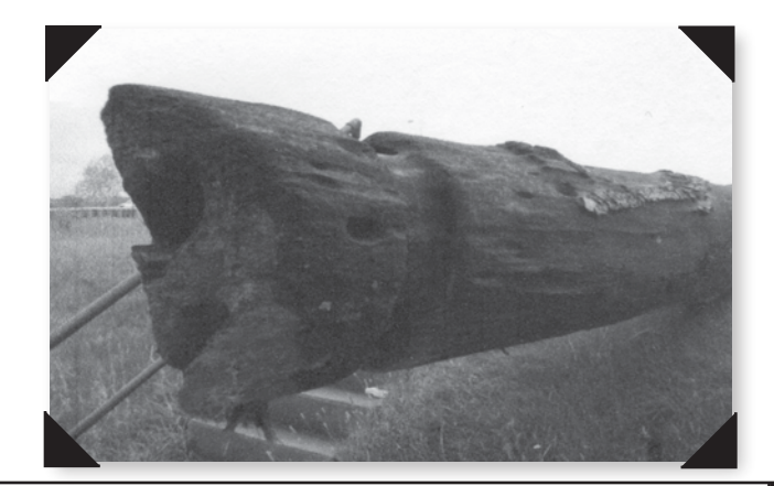
This log is 40 feet long and it is 30 inches across at the butt end, the butt end is also cut to a wedge shape.