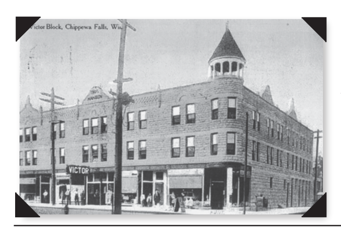
Victor Block Chippewa Falls, WI